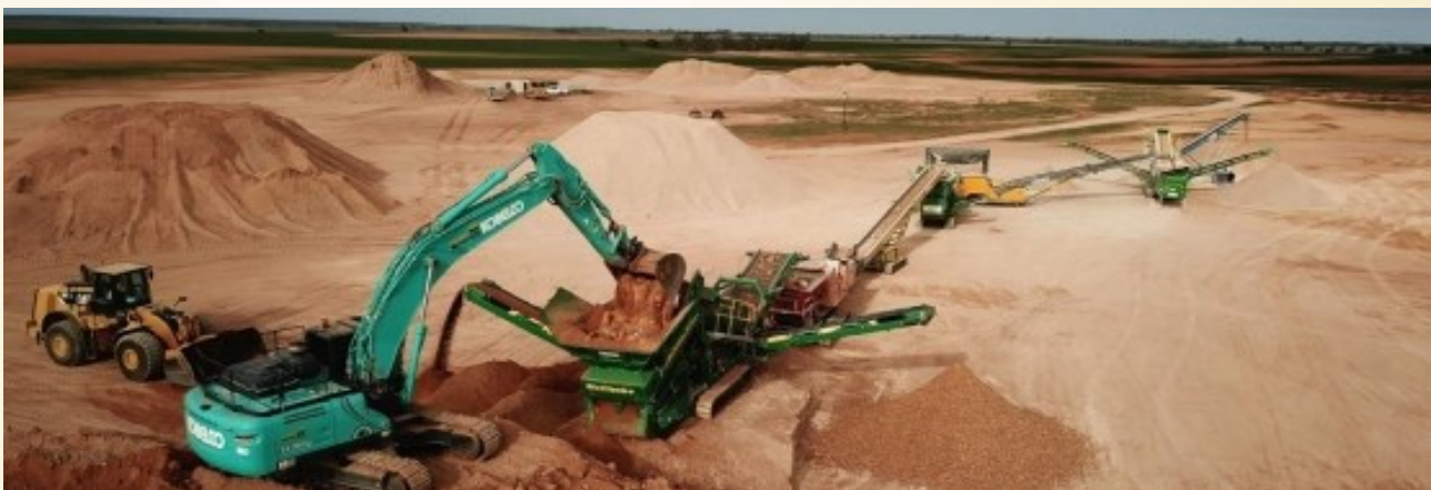
Photo: Limestone Quarry Meringur Vic