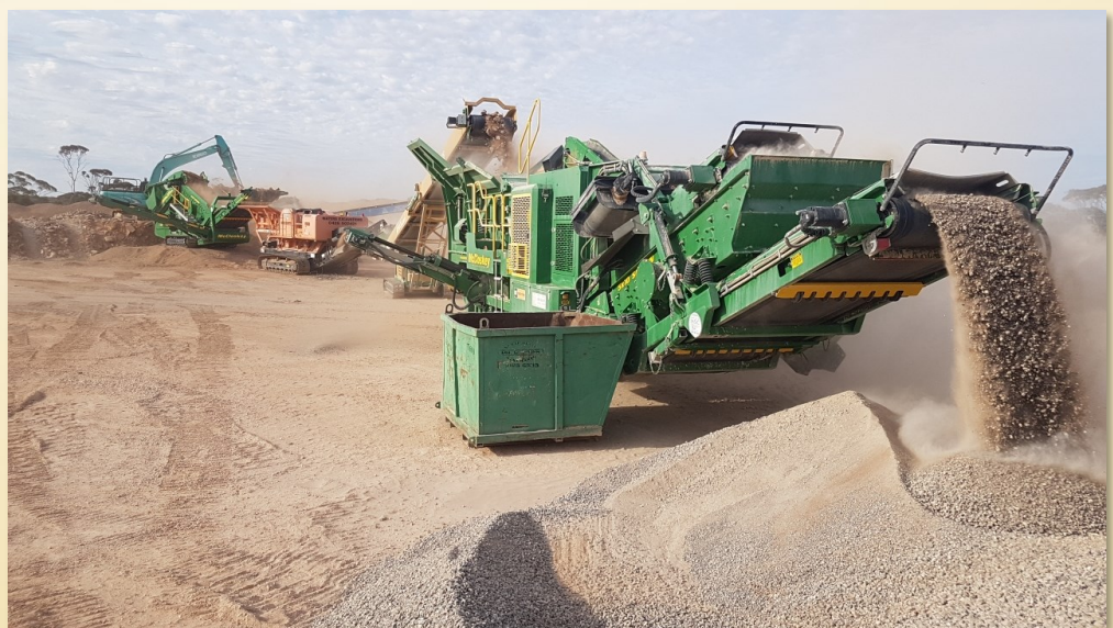
Photo: Screening Waste Concrete at Waters Industrial Recycling.

To further support our waste reduction initiatives, we operate a comprehensive modern range of quarry equipment. This equipment enables us to crush and screen waste concrete, asphalt, and brick, processing the waste into sustainable products that can be resold directly to the public. Our product range includes a diverse selection of recycled aggregates, road base, sand, and crusher dust, all produced from the processed waste materials. Additionally, we are proud to offer various limestone products that are extracted from our nearby quarry, further expanding our range of sustainable construction materials.