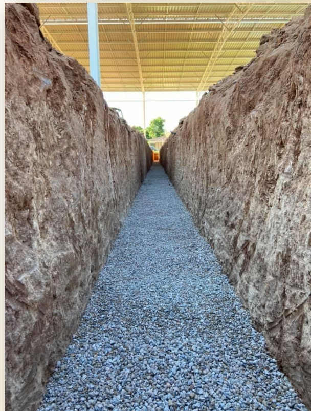
Photo: 4/10mm Concrete Aggregate

By choosing our services, you contribute to the preservation of the environment and also support the local community by reducing the strain on landfills and promoting the use of recycled materials in construction projects.